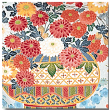
"Flower Garden" (Kimura Uzan)

(石川新情報書府サイトから引用 http://shofu.pref.ishikawa.jp/shofu/yuuzen/yuuzen_e/works.htm )